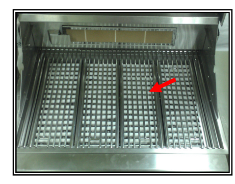
Then place grates on ceramic tubes with flat tray.