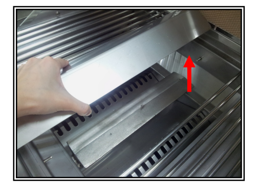
Remove grates and flame tamers first.