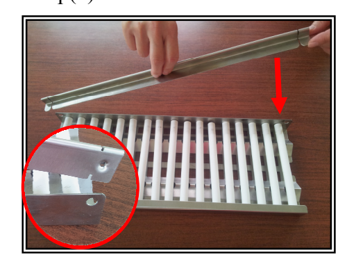
After new ceramic tubes replacement, aim at two holes and press down the barrier to fix the end cap.