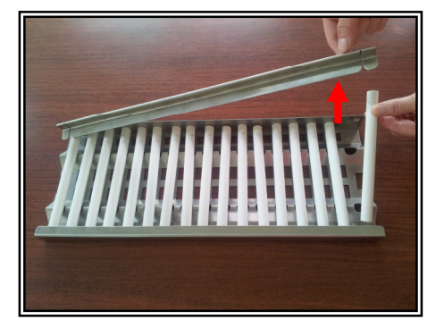
Push up the barrier and replace with new ceramic tubes.