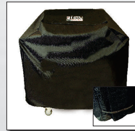
CANVAS CART COVER L60000/L75000 - CC630547 - L90000 - CC506723 -