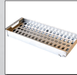
CHARCOAL TRAY - L109673 -