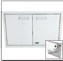
DOUBLE DOOR W/ TOWEL RACK - L3322 -