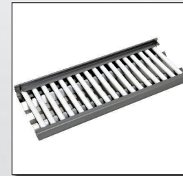
HEAT TUBES - L89746 -