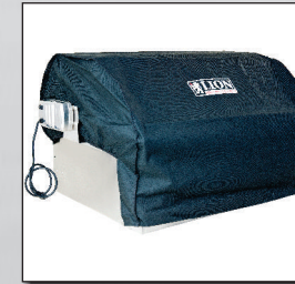
L60000/L75000 BUILT-IN CANVAS COVER - 41738 -