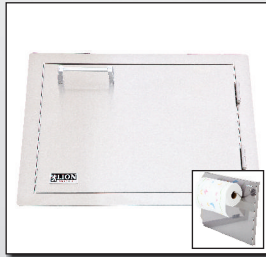
HORIZONTAL DOOR W/ TOWEL RACK - L2219 -