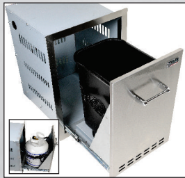
MULTI FUNCTIONAL BIN - L55628 -