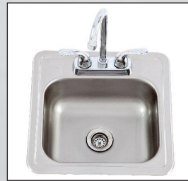
BAR FAUCET & SINK - 54167 -