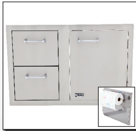
DOOR / DRAWER COMBO W/ TOWEL RACK - L3320 -