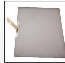
LION PREMIUM GRIDDLE - 62734 -