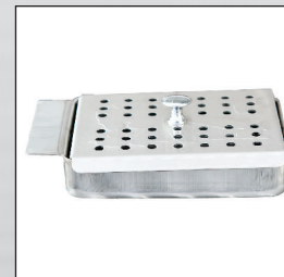
STAINLESS STEEL SMOKER BOX