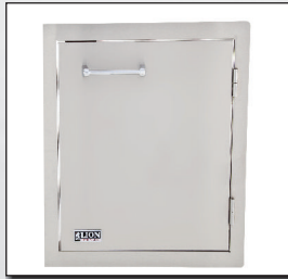
VERTICAL DOOR - L62945 -