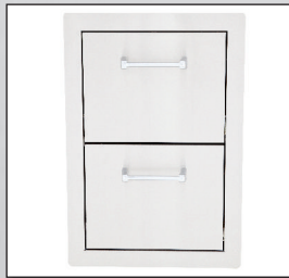
DOUBLE DRAWER - L2374 -