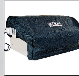
L90000 BUILT-IN CANVAS COVER - 62711 -