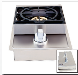
SINGLE SIDE BURNER - LP L6247 NGL5631 -