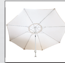
UMBRELLA - L1647 -