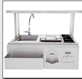
30" BAR CENTER - 19836 -