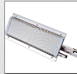
SEARING BURNER - 53218 -