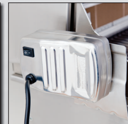
ROTISSERIE & BACK BURNER HEAVY DUTY GEAR ACTION MOTOR