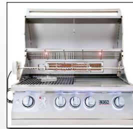
ROTISSERIE W/HEAVY DUTY GEAR ACTION MOTOR - L75007 -