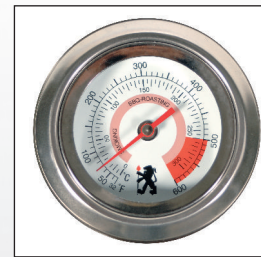
COMMERCIAL TEMPERATURE GAUGE