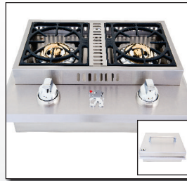
DOUBLE SIDE BURNER - LP1707 L1634 NG1634 -