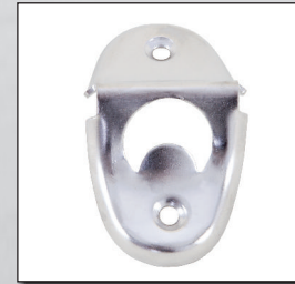
BOTTLE OPENER - 48163 -