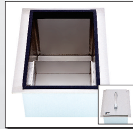
ICE CHEST - L5312 -