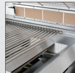
CAST STAINLESS STEEL BURNER