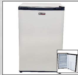
4.5 CU. FT REFRIGERATOR - L2002 -