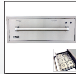
WARMING DRAWER - WD256103 -